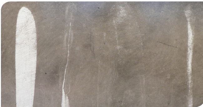
Berol DR-B1 formulation

Non-mechanical degreasing performance of a direct release approved alkaline Berol DR-B1 formulation compared with high pH commercial house washes at equivalent dilution (~0.2% surfactant concentration).